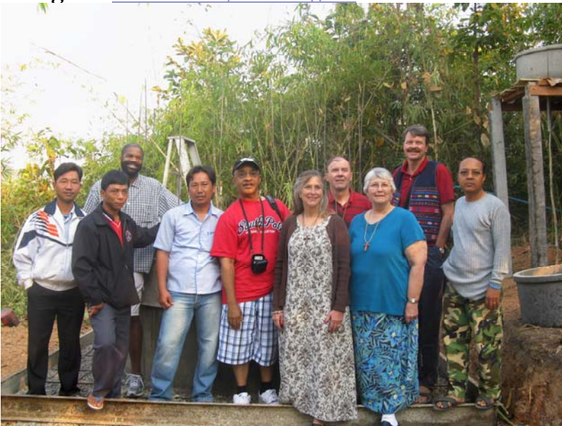
The mission team with some Akha village workers before worshipping together last Sunday.