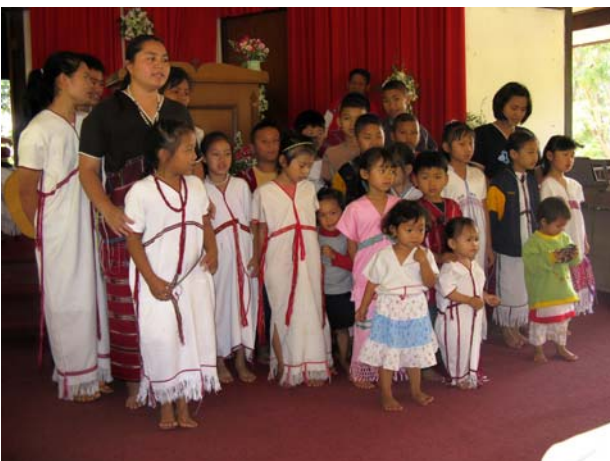
Karen Children's choir singing during the Karen church service on Feb. 15th.