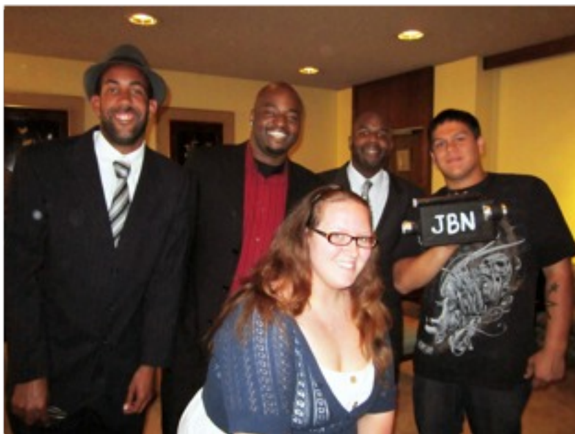
Young Adults who participated in a Palm Sunday drama, "A Report from the Coronation"

On Sunday, May 22 we will have another ALL-CHURCH POTLUCK following the Church School Classes, at 12:15 p.m. in the Robbins Dining Hall. Our theme for the day will be "Sharing the Caring Christ." Everyone is invited to stay and bring a dish to share. Sign-up sheets will be in the narthex following worship, or you may call the church office at (213) 384-2151 to indicate what food you will bring.