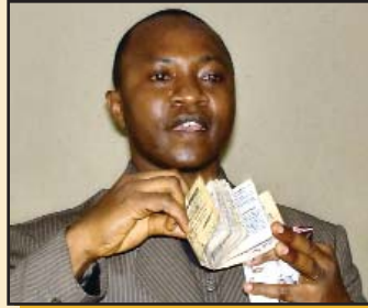
A distributor in Cameroon shares how his copy of Satan versus CHRIST is worn out from much use.

A group of young people in Ghana formed an out-reach ministry with one aim: to save a life. "We believe that evangelism is not only about preaching the Person [of Jesus Christ], but also allowing that Person to become alive to save a life. Because of this, we require your booklets and would really appreciate if you can help us. Getting to read one of your booklets, The Way to God , was a dream come true. We can't wait to share with others."