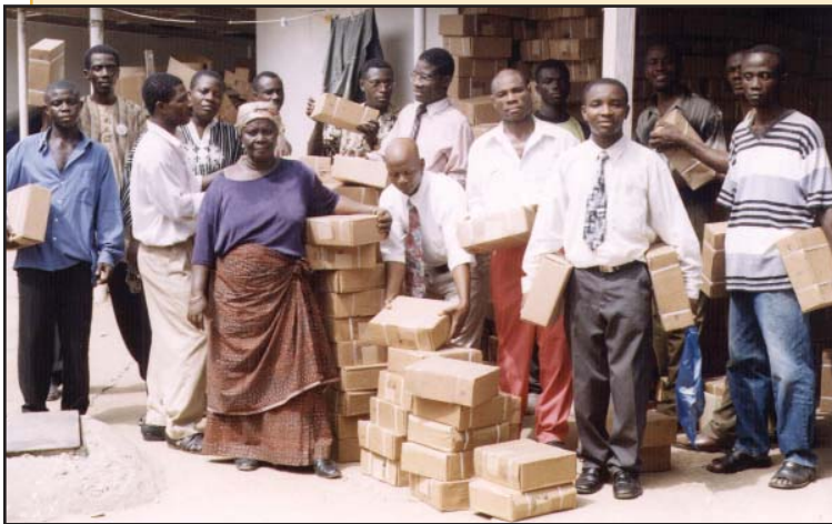
Hundreds of distributors receive boxes of booklets through our national coordinator in Accra, Ghana.