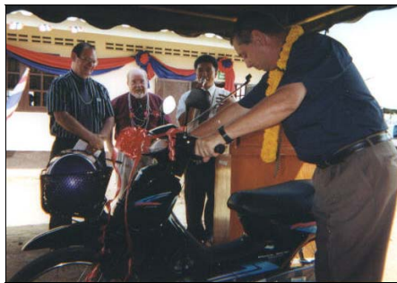
The Margaret Coles Memorial Fund donated a motorcycle to Akha evangelist who travels to mountainous villages up rugged roads and paths.