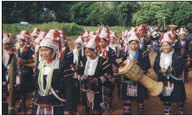
Akha villagers from surrounding mountainous areas in procession for the governor of the province.