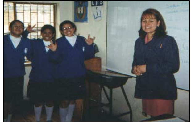
Older children with a teacher at school for the hearing impaired.