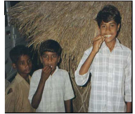
Children in India using sticks and their fingers to brush their teeth.

Over 1,000 health kits were made available for the cost of $500. Each health kit contains a toothbrush, toothpaste, and a Good Life Guide . The message that Jesus loves these little ones is free.