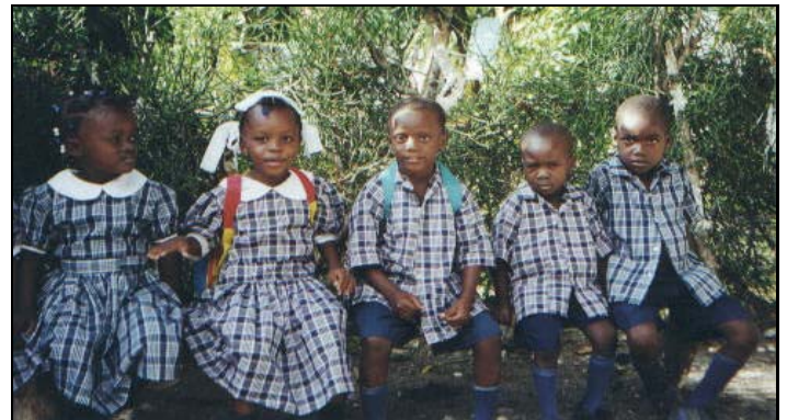
CMM's vitamin program makes these Haitian children happy and healthier.