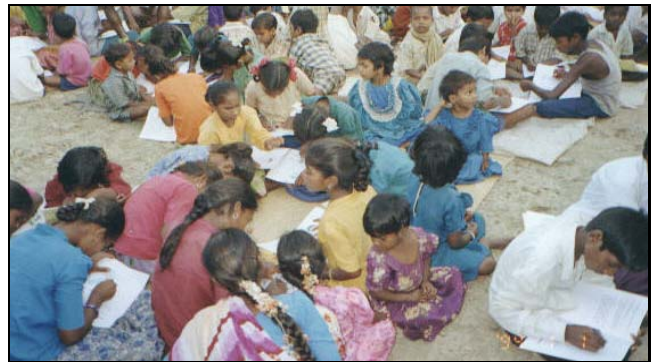
The CMM ministry in India is currently having the Good Life Guides printed locally.