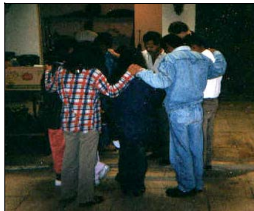
A family accepting Christ in Quito, Ecuador during a wheelchair distribution.