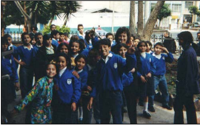
Happy hearing-impaired children will be among the first to benefit from CMM's Vitamins For Kids Program.