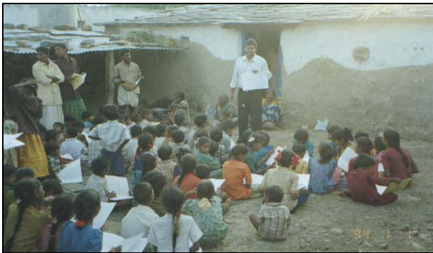
Children listening to CMM's primary healthcare presentation prior to showing the Jesus Film .