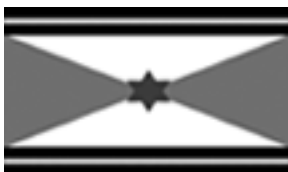
The Akha Flag

While locals might claim that attitudes which prevailed in Salem during the displacement of Native Americans off the land and mistreatment of minority communities have changed, one can say that DEMOGRAPHIC change in Salem has an increasing impact on that change.