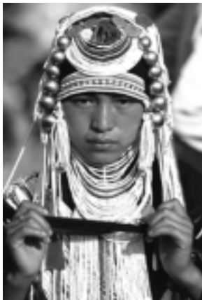
The Akha - The Most Colorful People in SE Asia

Recent protests at the Capitol give light to just another commercial use of Oregon's lands. Yet buying a small farm is getting harder and harder for the