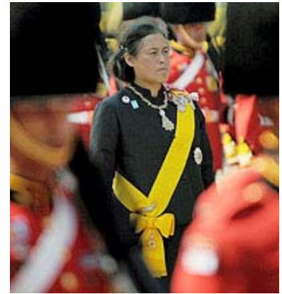
Princess Sirindhorn is preferred...

The government of generals and bureaucrats installed by the 2006 coup-makers performed miserably. In last December's elections, though TRT had been disbanded, Mr Thaksin's new People's Power Party won most seats. This spurred the PAD to resume its protests. In clashes in October PAD members fought the police with guns, bombs and sharp staves, hoping the army would again use disorder as the pretext for a coup. The PAD nevertheless blamed the clashes entirely on police brutality, and the anti-Thaksin Bangkok press let it get away with this. The death of one PAD member, apparently blown up in his car by the bomb he was carrying, was quickly buried. But the death of a young woman, reportedly when a police tear-gas canister exploded, became a cause célèbre .